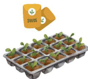
Seeds and Plants that Produce Food*