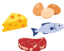
Meat, Fish, Eggs, and Dairy*