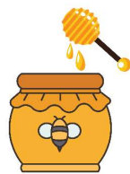
Honey and Maple Products*