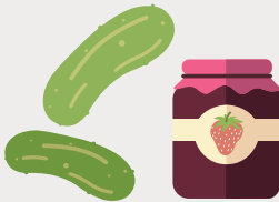
Kua Nplaum, Jellies, Zaub Pos, thiab Cov Kua Txuj Lom