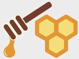
Khoom Muag Ua Los Ntawm Zib Ntab thiab Nplooj Ntoov Maple