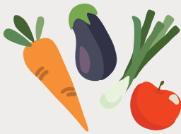
Txiv Hmab Txiv Ntoov thiab Zaub*