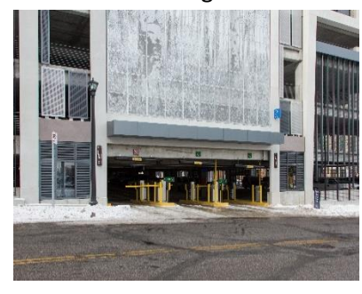
334 Chicago Avenue